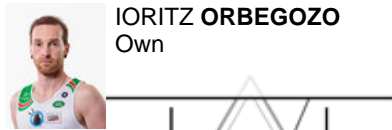
IORITZ ORBEGOZO Own