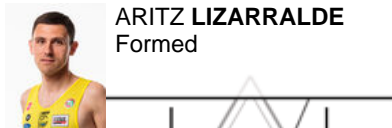
ARITZ LIZARRALDE Formed