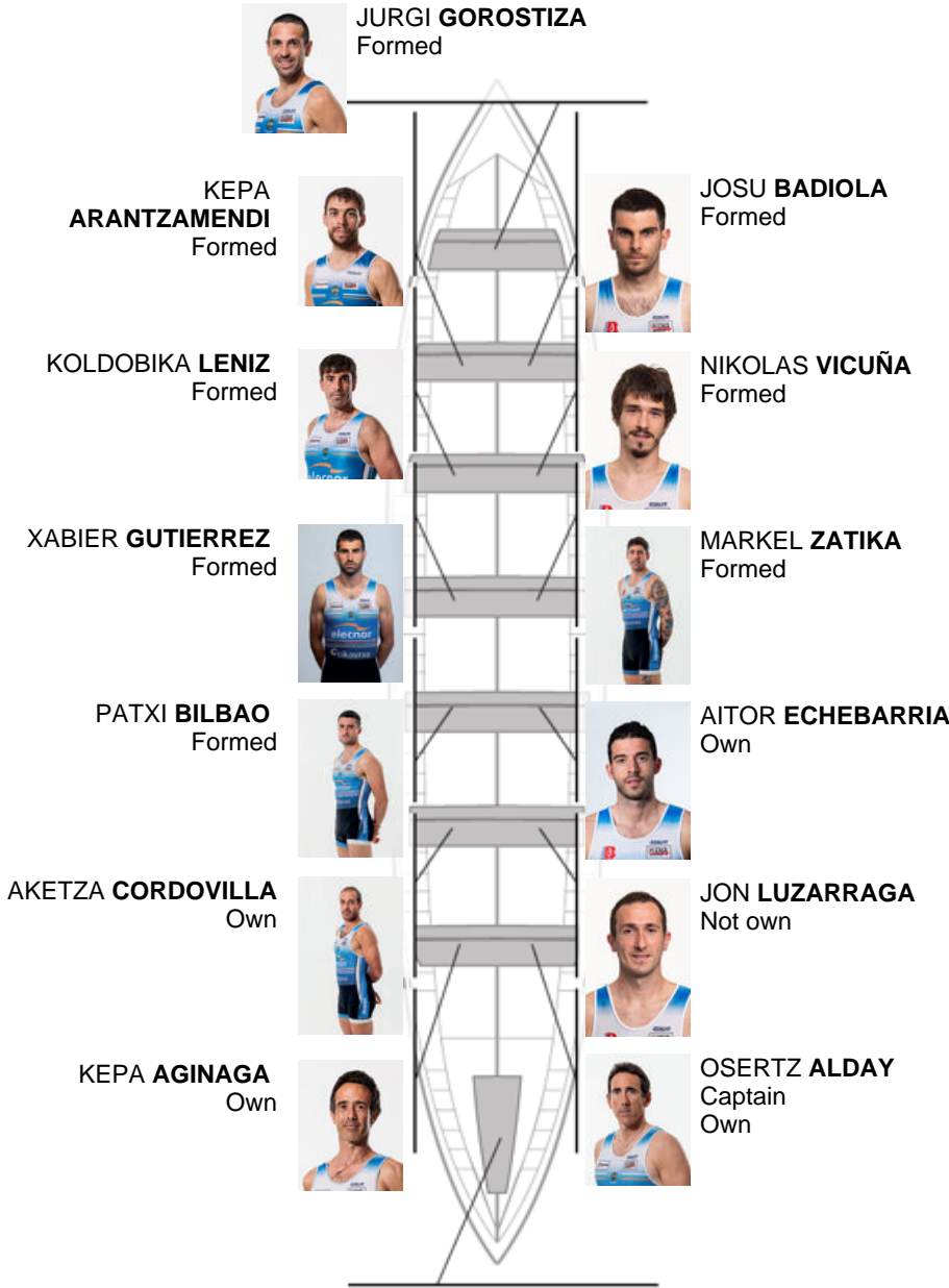
IÑAKI GOIKOETXEA Formed